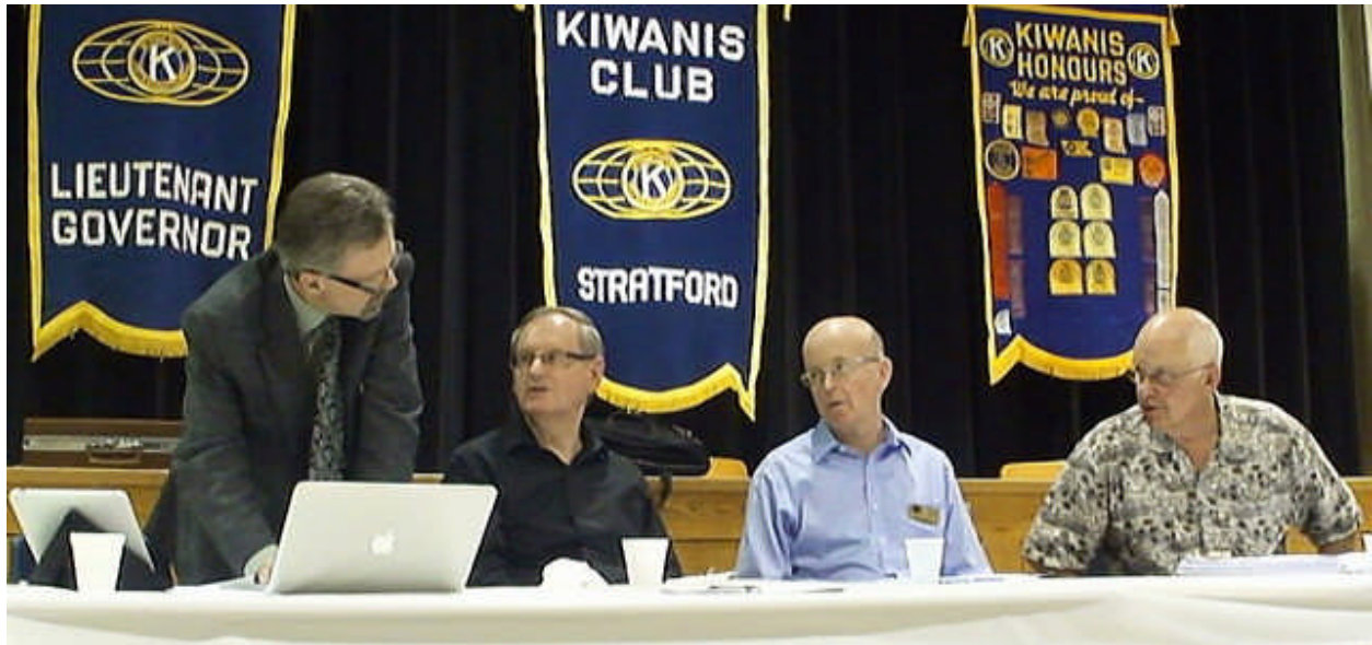
The AGM Presenters